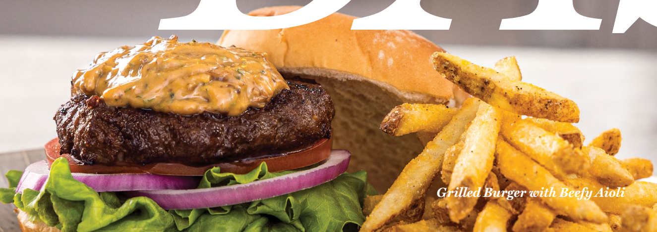
Grilled Burger with Beefy Aioli