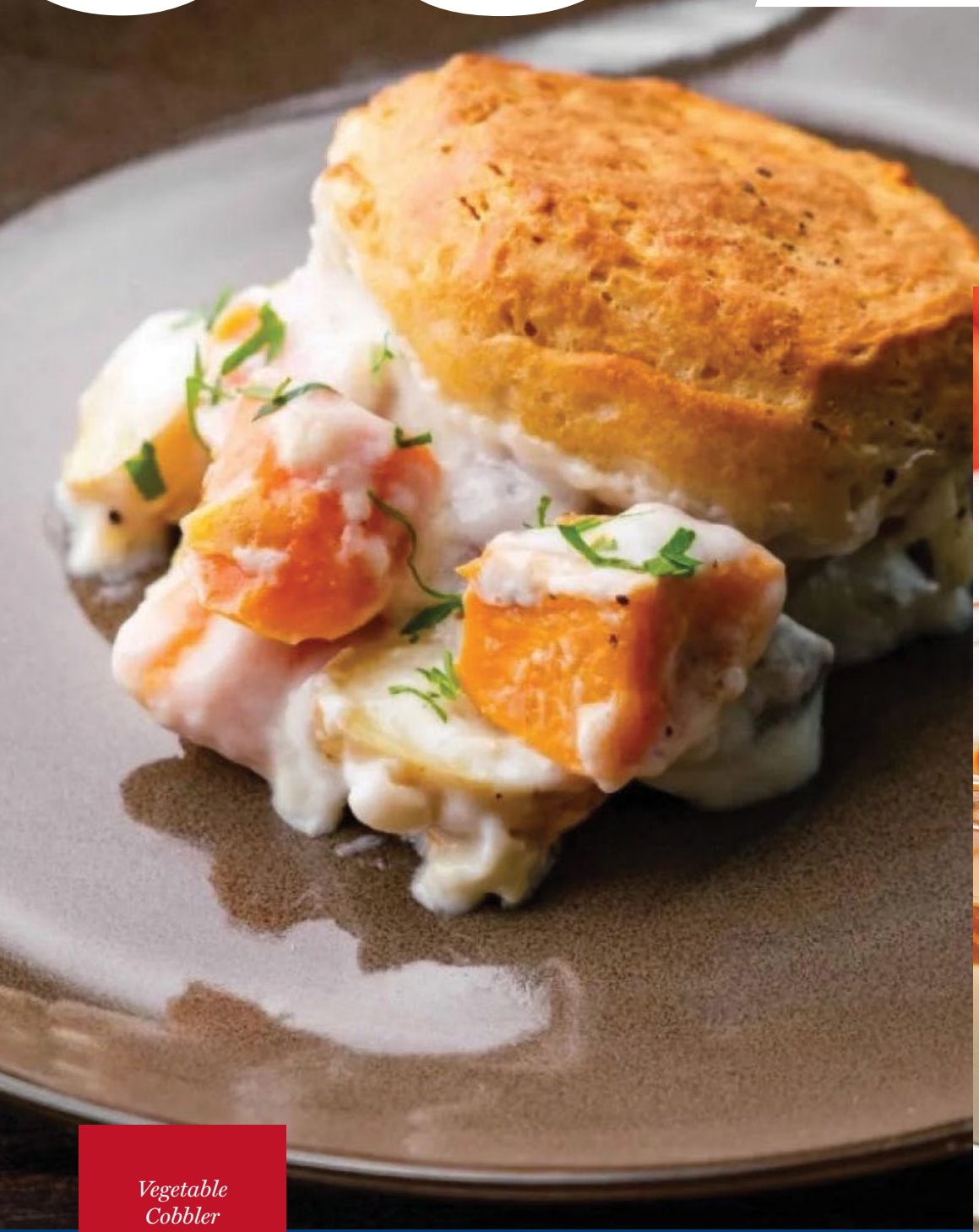
Vegetable Cobbler with Herbed Biscuits