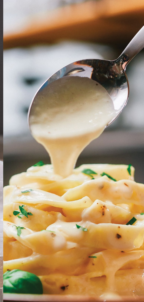
Vegan Fettuccine Alfredo