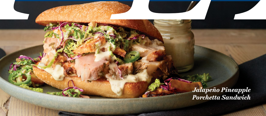
Jalapeño Pineapple Porchetta Sandwich