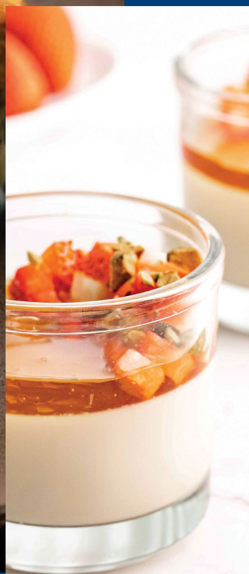
Oat Milk Panna Cotta with Pistachios, Strawberries and Raw Milk