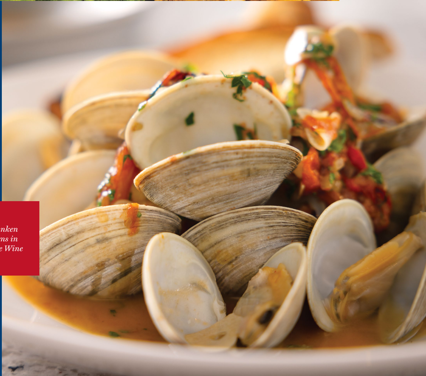
Drunken Clams in White Wine