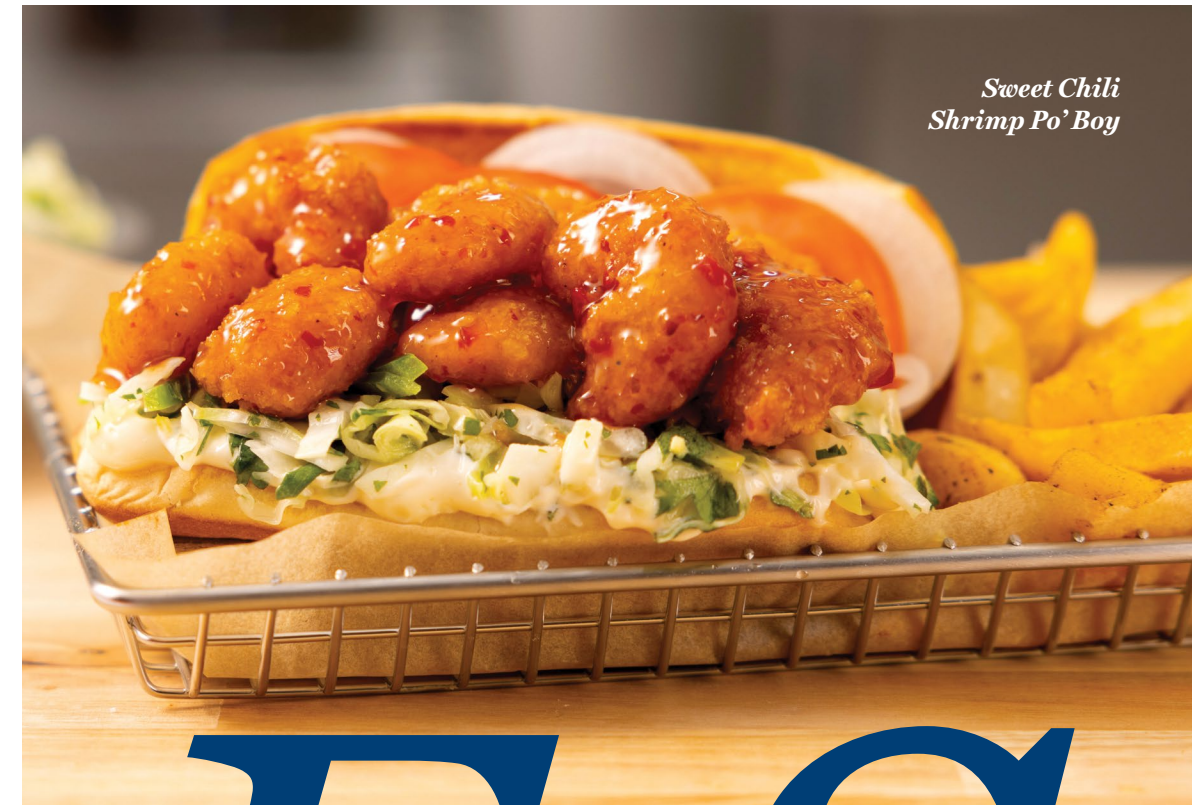
Sweet Chili Shrimp Po' Boy

Sweet and tangy citrus flavor is complemented by garlic, soy, ginger and toasted sesame.