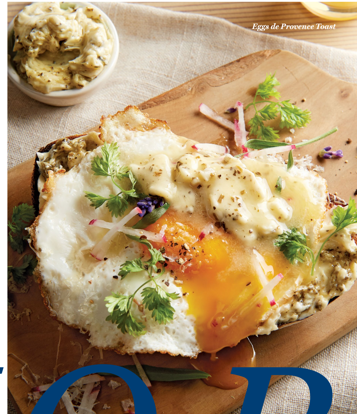
Eggs de Provence Toast

Brighten a variety of dishes with the full flavor of roasted garlic.