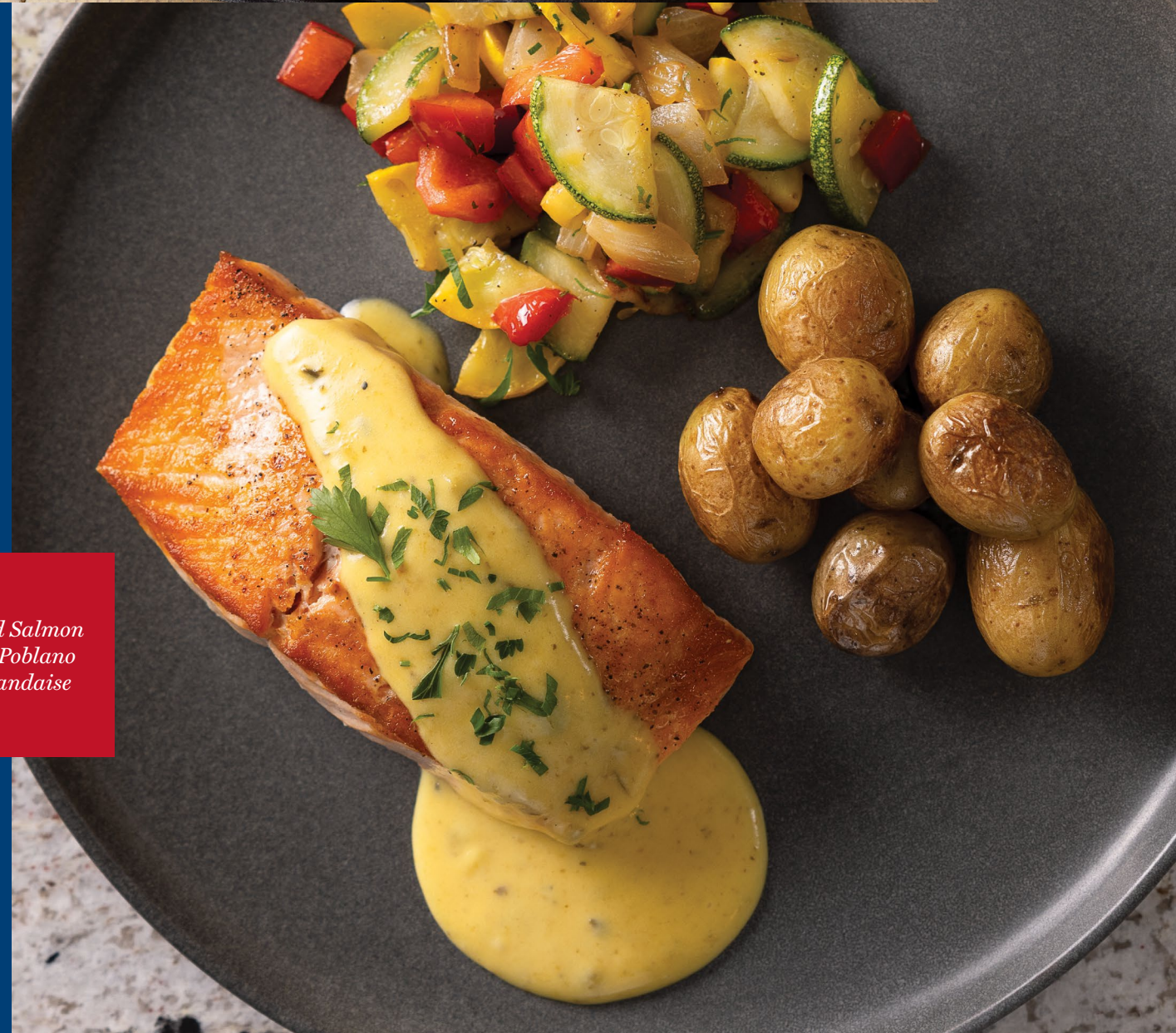
Seared Salmon with Poblano Hollandaise