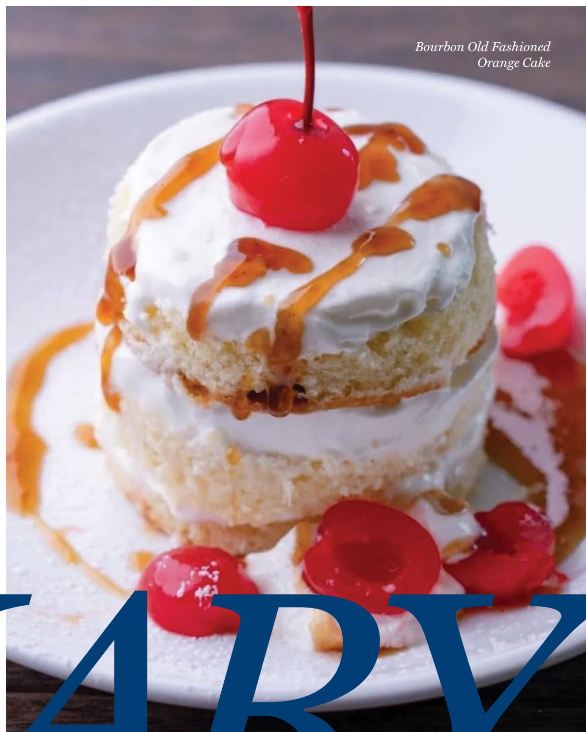
Bourbon Old Fashioned Orange Cake