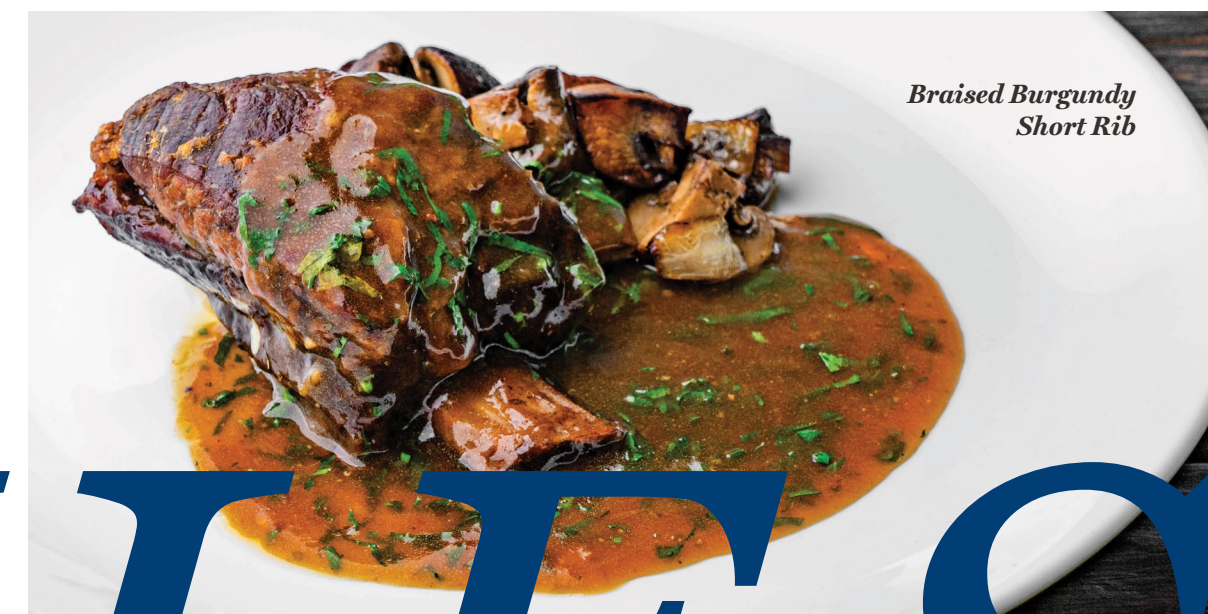
Braised Burgundy Short Rib