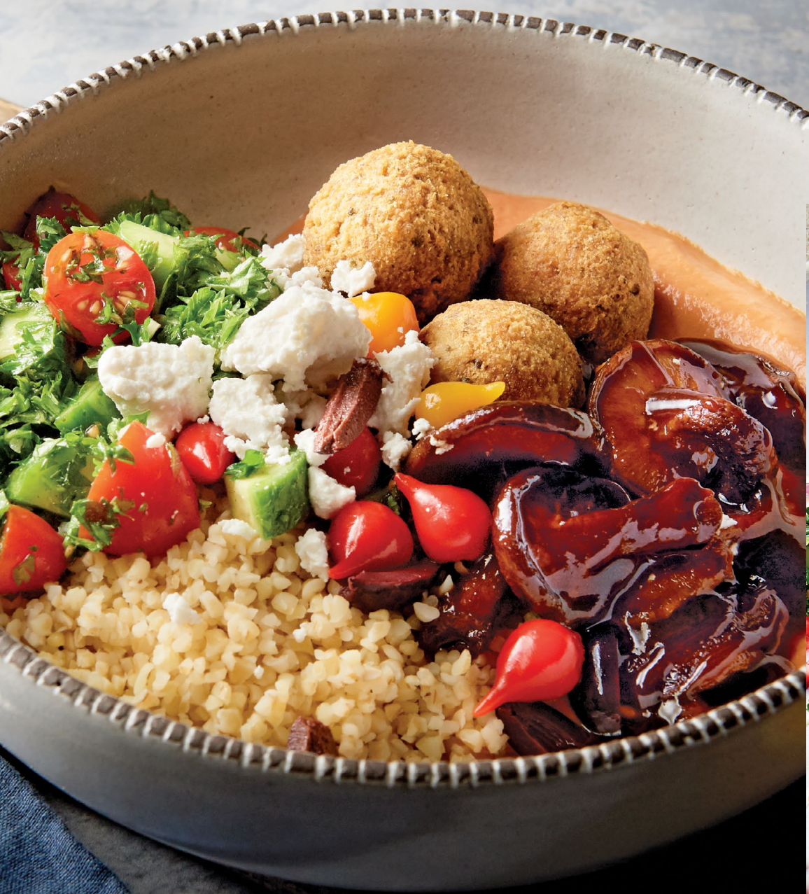
Mediterranean Falafel Bowl