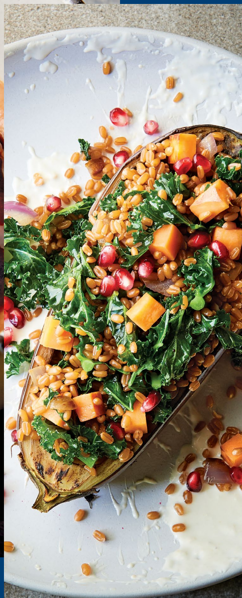
Eggplant and Garlicky Lentils