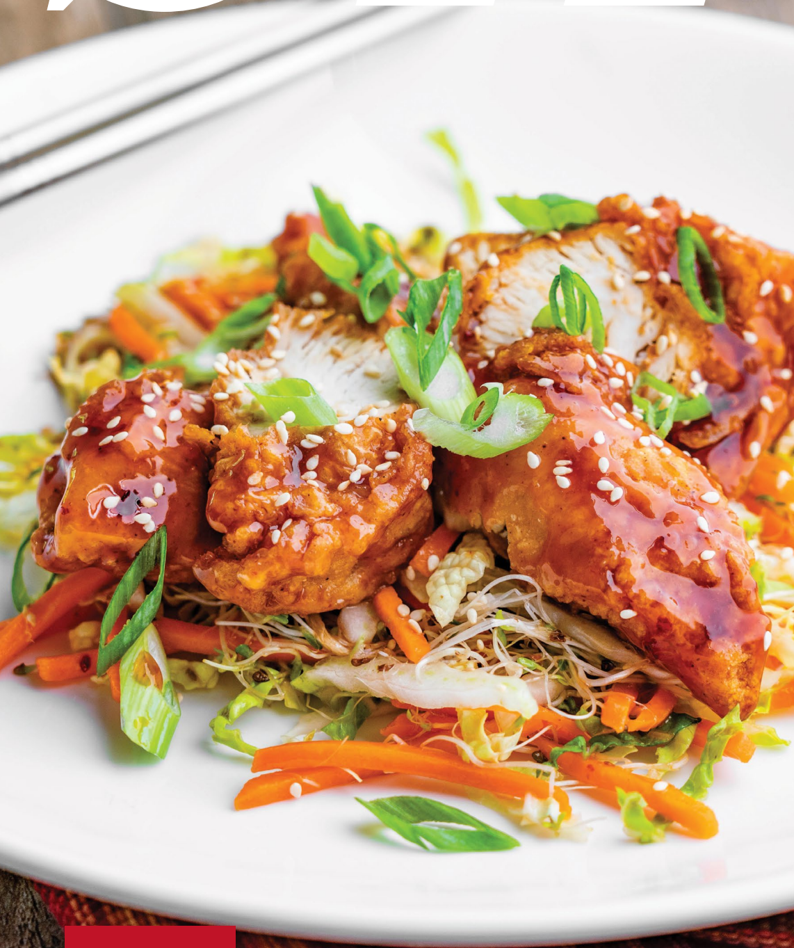
General Tso's Chicken Salad