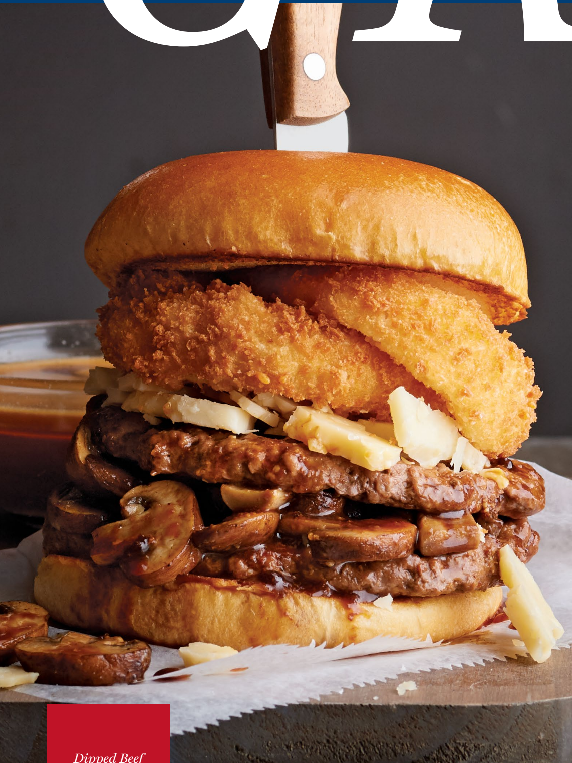
Dipped Beef Umami Burger

A rich, savory sauce made from a reduced brown stock and accented with a special blend of garlic and onion.