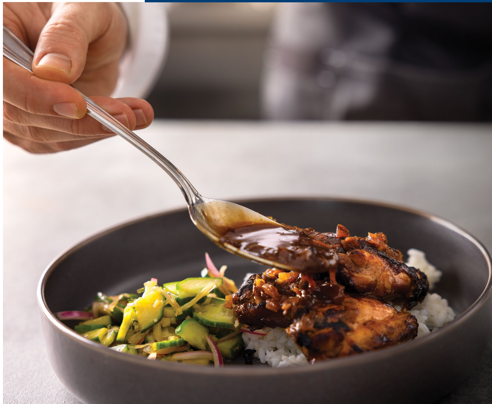
Chicken Ancho Adobo

*Datassential, Extedibility Study, 2023.