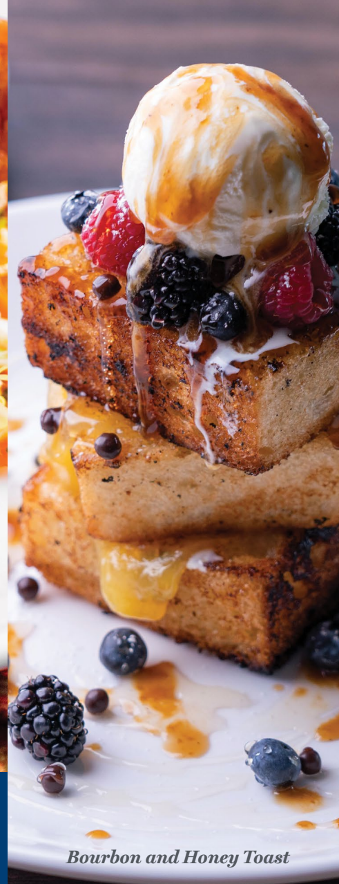
Bourbon and Honey Toast